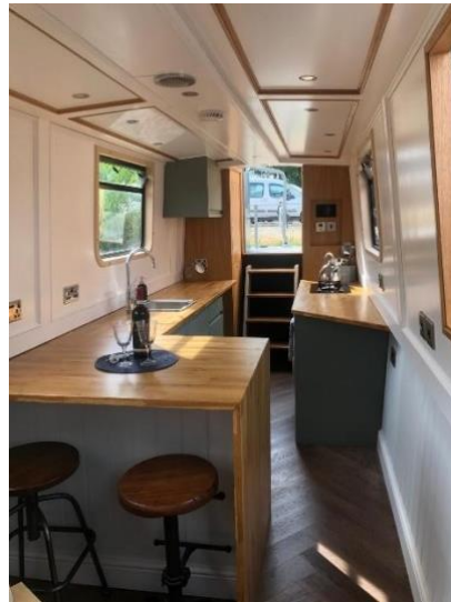
▲ Galley looking aft