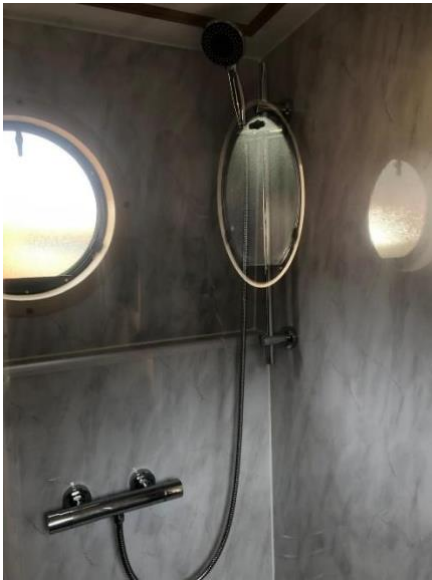
▲ Shower room