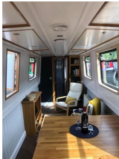
▲ Saloon facing forward