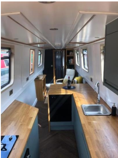
▲ Galley facing forward