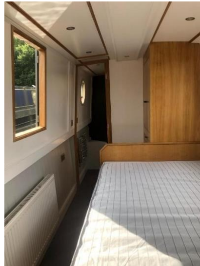
▲ Bedroom facing fore Bedroom facing aft