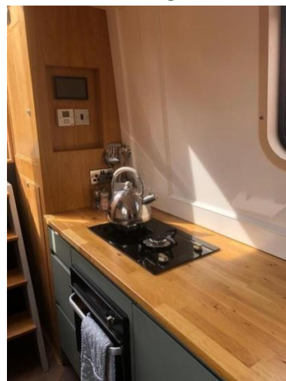
▲ Galley facing aft