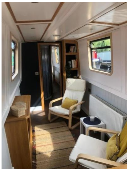
▲ Saloon looking forward