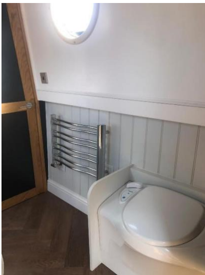
▲ Shower room ▲ Bedroom facing fore