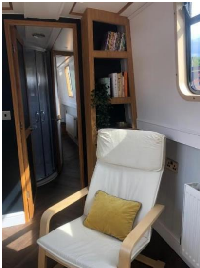
▲ Saloon facing fore