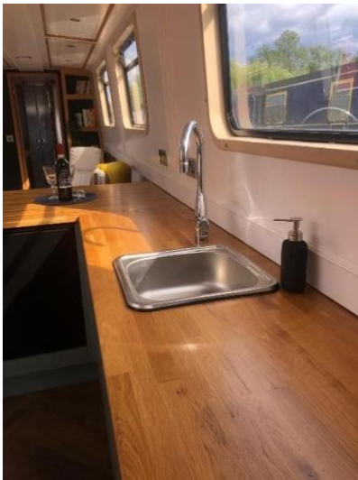
▲ Galley facing fore