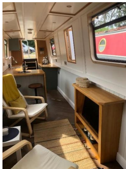
▲ Saloon facing aft