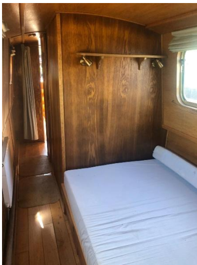
Main Bedroom facing aft