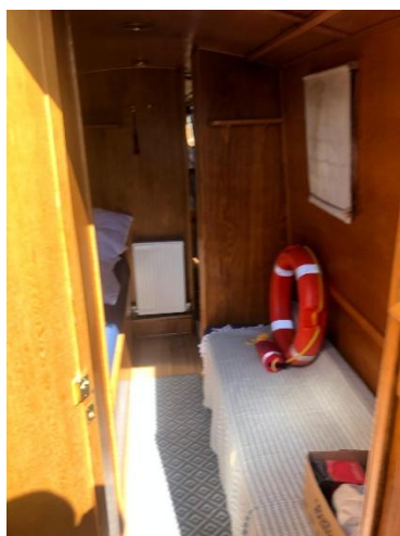
▲ Bedroom 2 facing fore