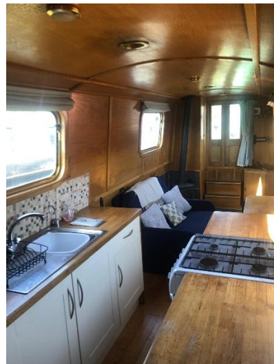
Galley facing fore