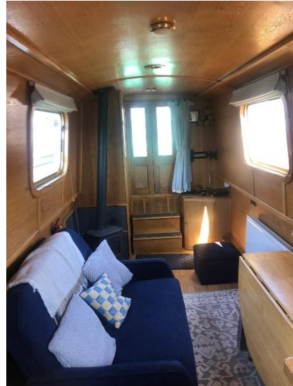
Saloon facing fore