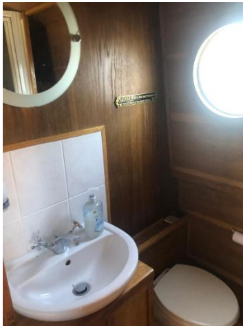
▲ Main toilet