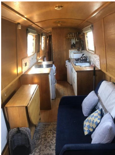
Saloon facing aft