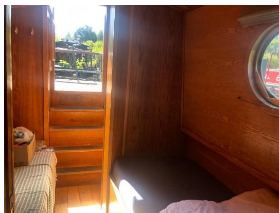
▲ Rear bedroom facing aft