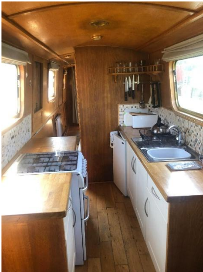
Galley facing aft