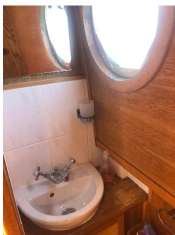
▲ Rear toilet