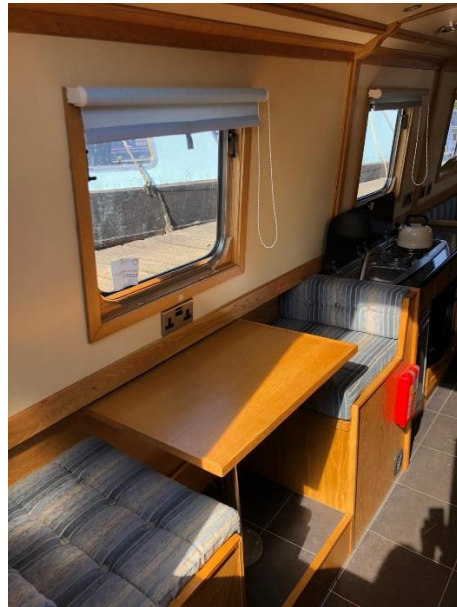
▲ Saloon facing fore