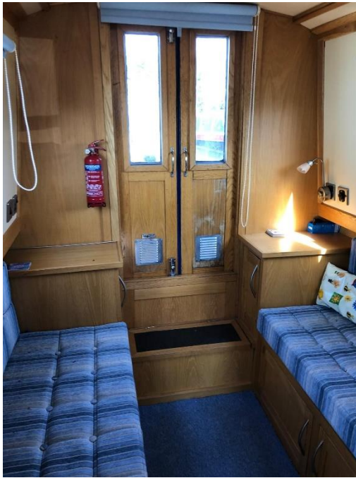
▲ Cabin facing fore