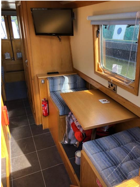
▲ Saloon facing aft