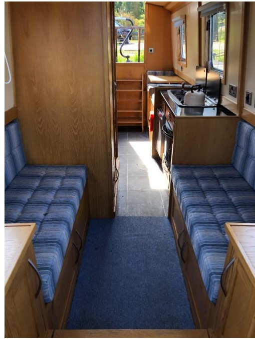
▲ Cabin facing aft