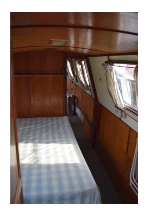
▲ Bedroom facing fore