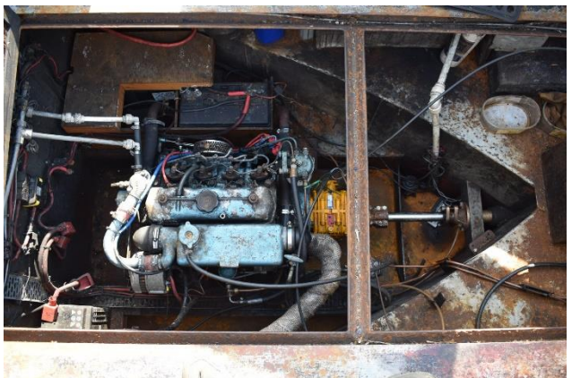
▲ Thornycroft engine