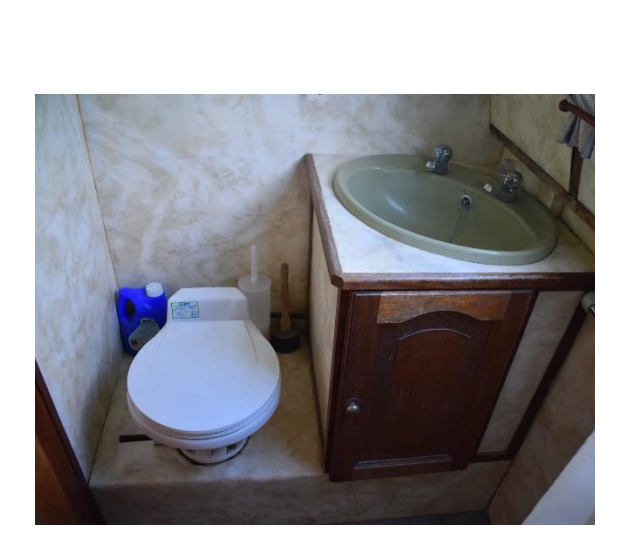
▲ Toilet and sink