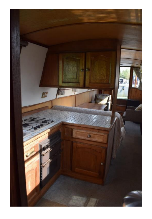
▲ Galley facing fore