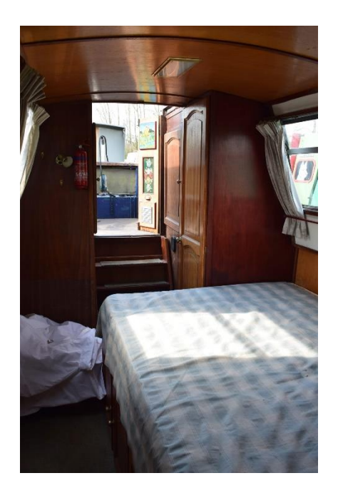
▲ Bedroom facing aft