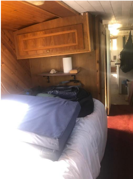
▲ Bedroom facing fore