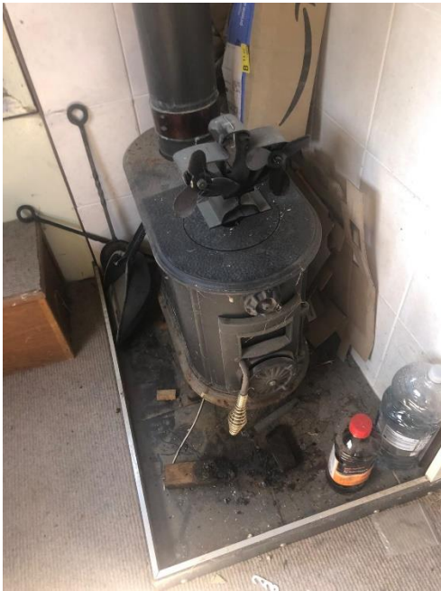
▲ Saloon stove