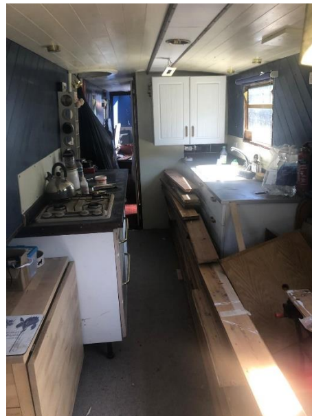
▲ Galley facing aft