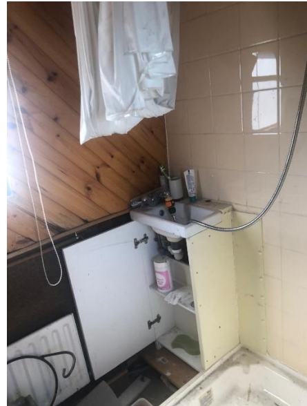
▲ Shower room