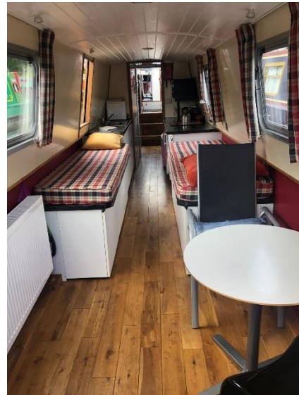
Saloon facing aft