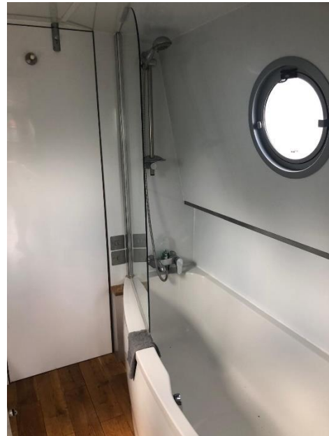
▲ Bath with overhead shower