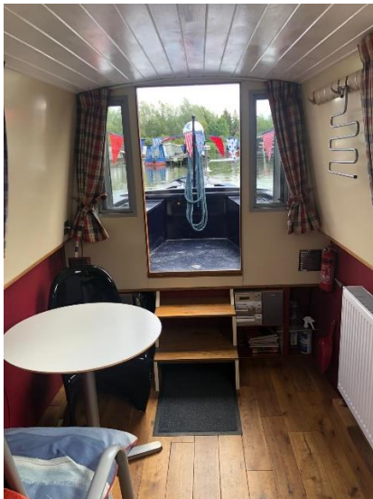
Saloon facing forward