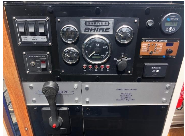
▲ Control Panel