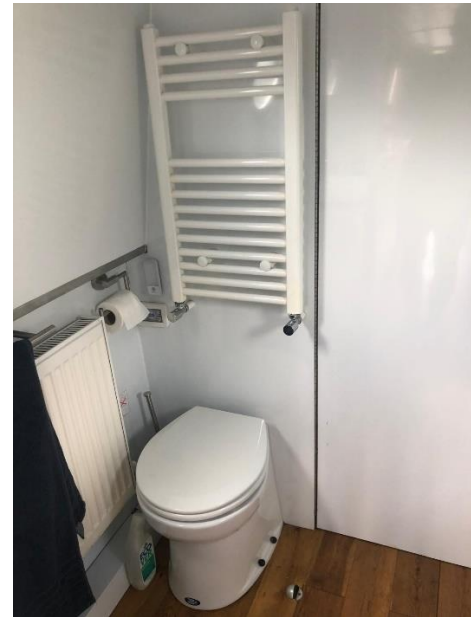
▲ Pump out toilet and towel rail