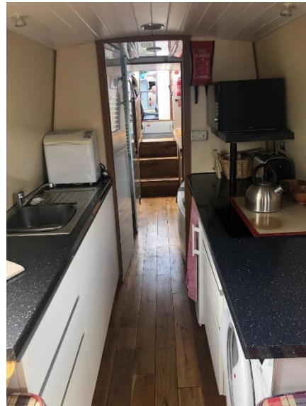
▲ Galley facing aft