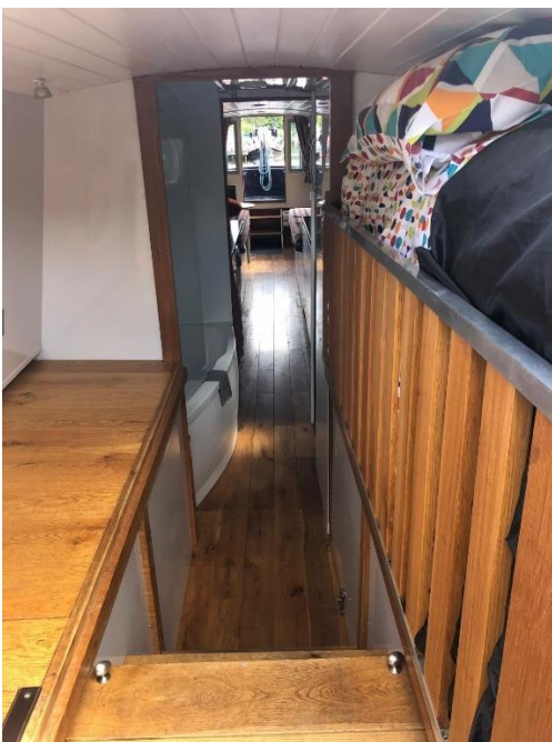
▲ Bedroom facing fore