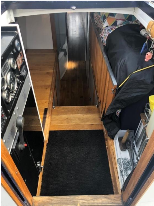
▲ Semi trad stern