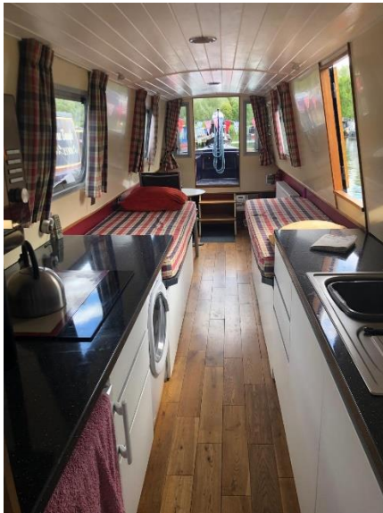
▲ Galley facing fore