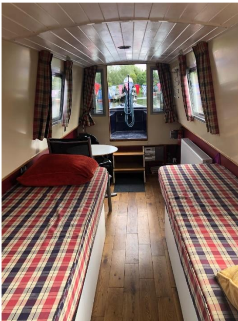
Saloon facing fore