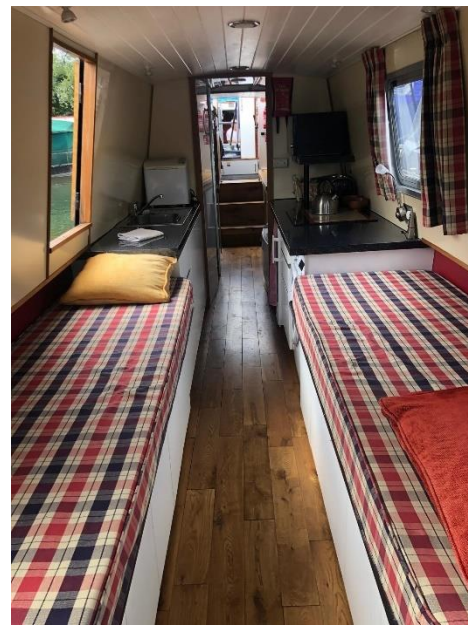
Saloon facing aft