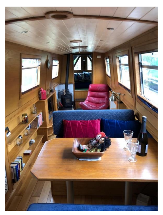
▲ Dinette facing fore