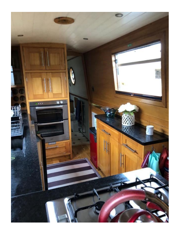
▲ Galley looking aft