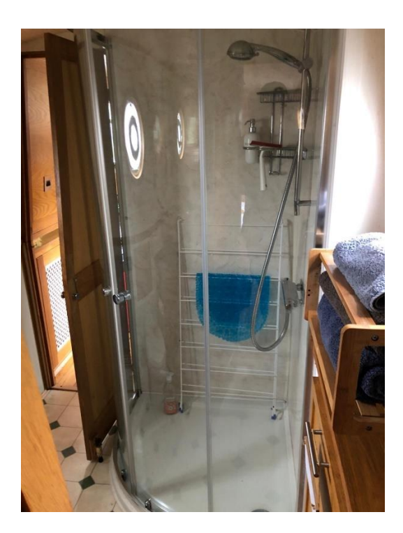
▲ Shower room facing fore