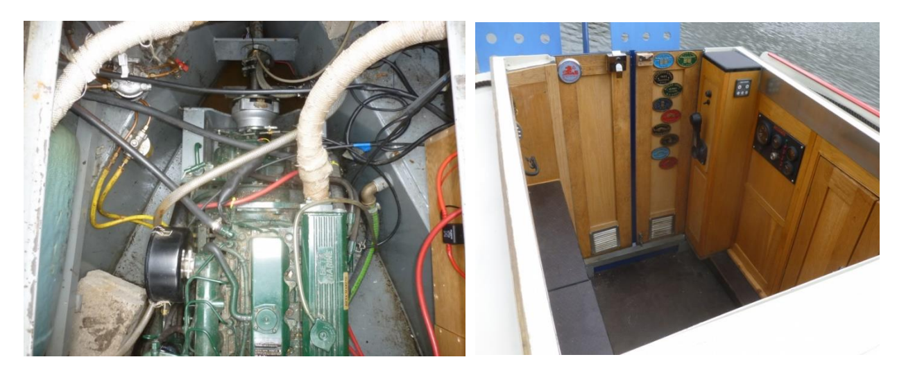
▲ Engine Bay