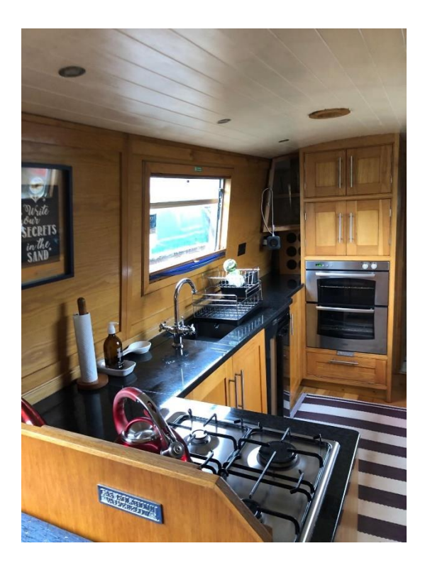
▲ Galley looking aft