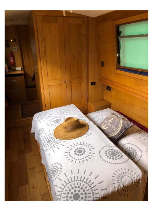
Bedroom facing aft