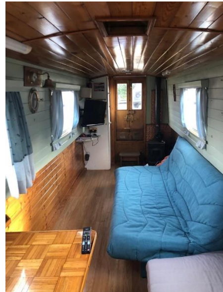
▲ Galley facing aft