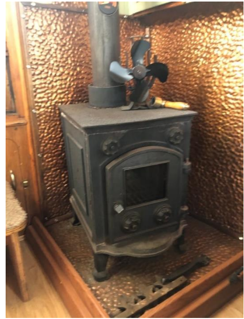
▲ Saloon facing aft