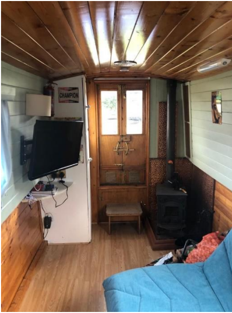
▲ Saloon to Bow doors