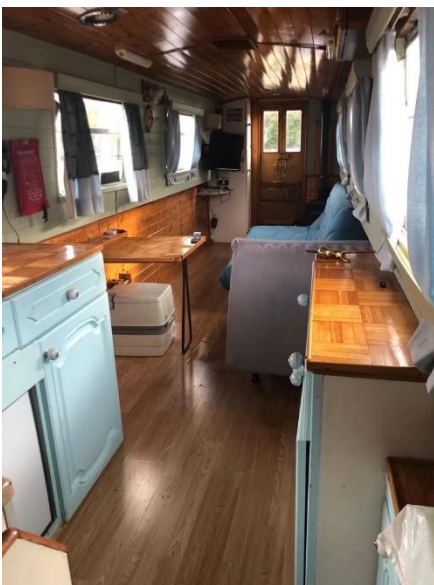
▲ Galley facing fore