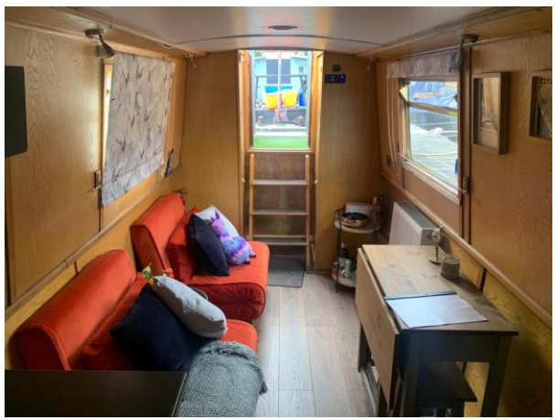
\blacktriangle Saloon facing aft