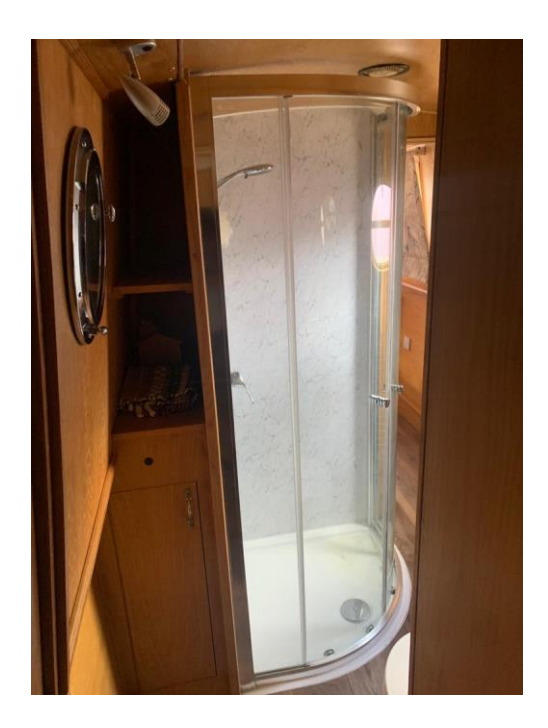
▲ Shower room