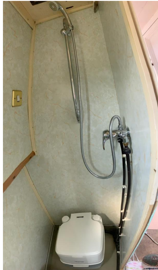
Left: Bathroom cabinet