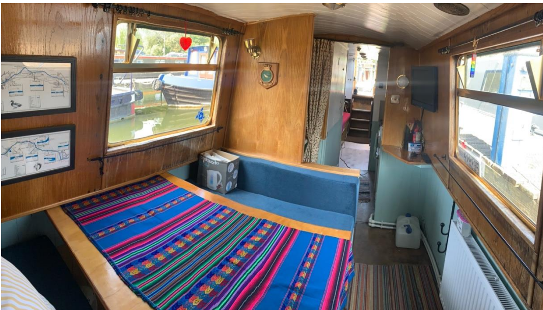
Top: Saloon/Bedroom from stern Bottom: Saloon/Bedroom to stern