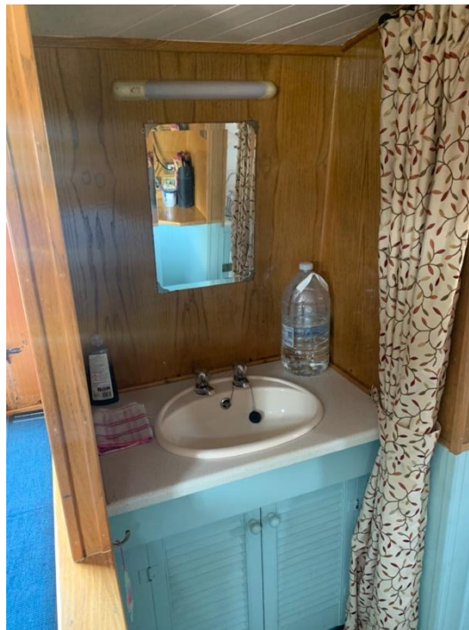
Clockwise from top: Galley from stern, Galley to Stern, Vanity Sink beyond Galley on starboard side