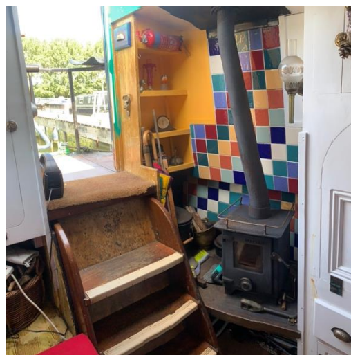
Clockwise from top: Saloon from stern, Saloon to Stern, Multi fuel burner in saloon