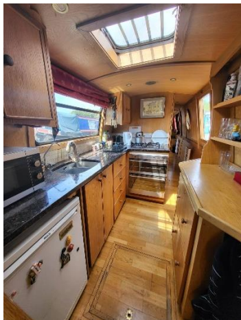
▲ Galley facing fore