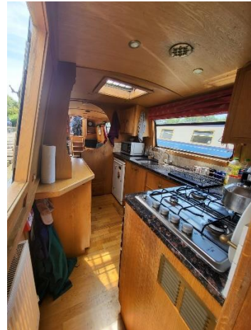
▲ Galley looking aft