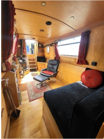
▲ Saloon facing aft