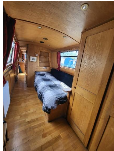
▲ Bedroom facing aft