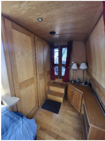
Bedroom facing fore