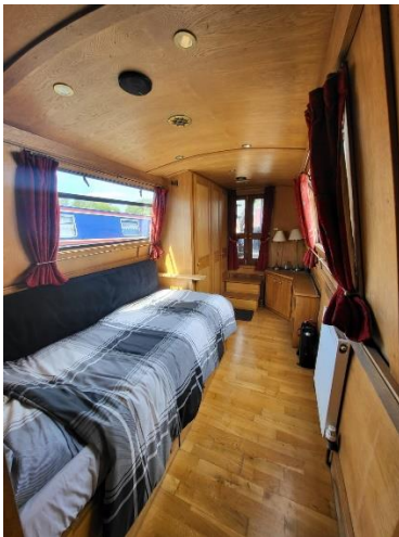
▲ Bedroom facing fore