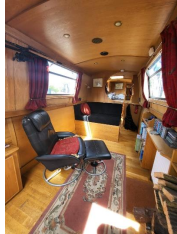
▲ Saloon facing fore