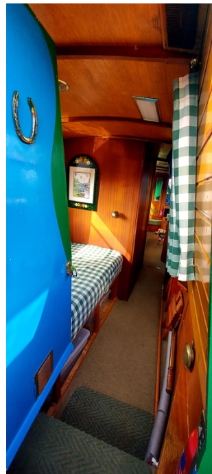
▲ Bedroom facing fore