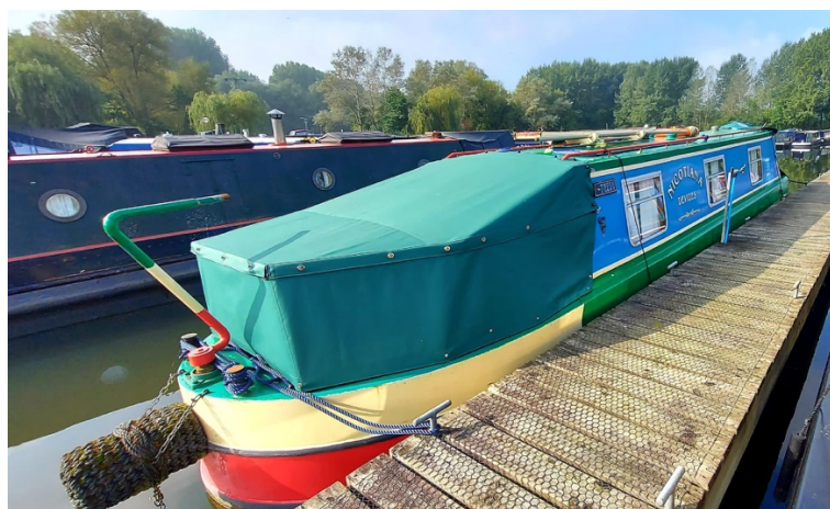
Bedroom facing aft