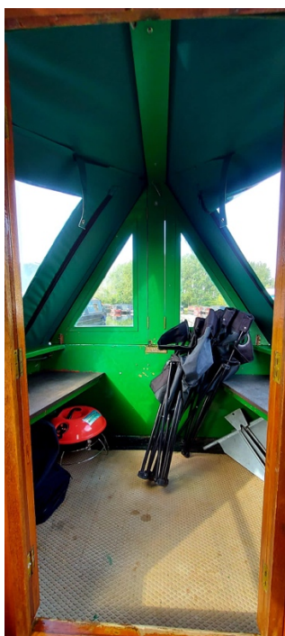
▲ Shower room