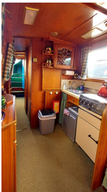
▲ Galley facing aft