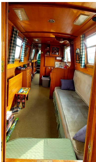
▲ Saloon facing aft