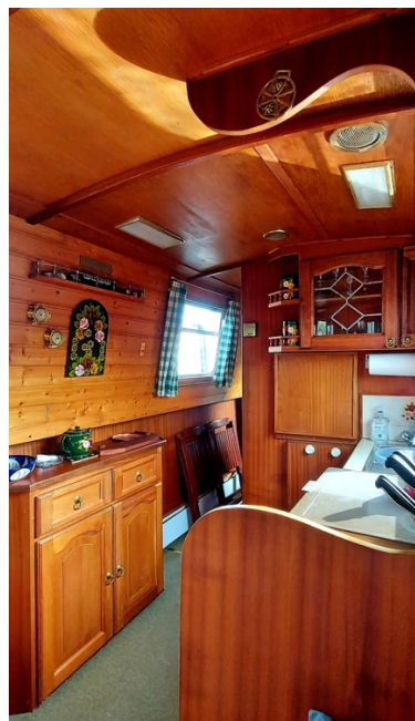
▲ Galley facing aft