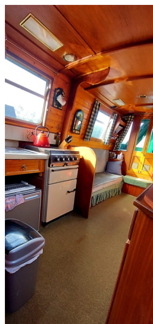
▲ Galley and Saloon facing fore