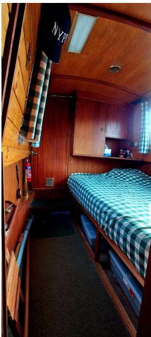
▲ Bedroom facing Aft