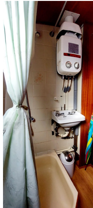
▲ Shower room