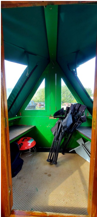
▲ Shower room