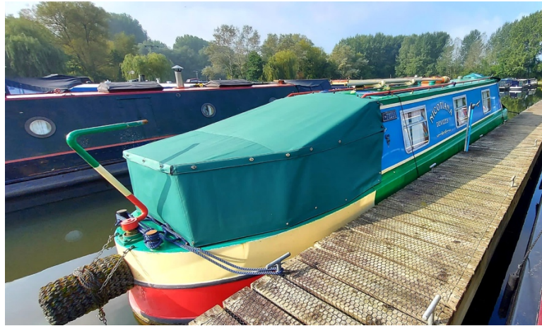
Bedroom facing aft