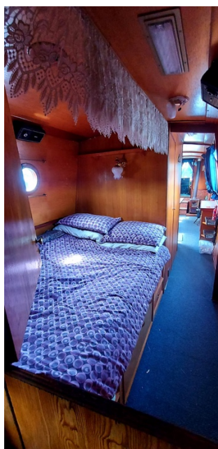
▲ Bedroom facing fore