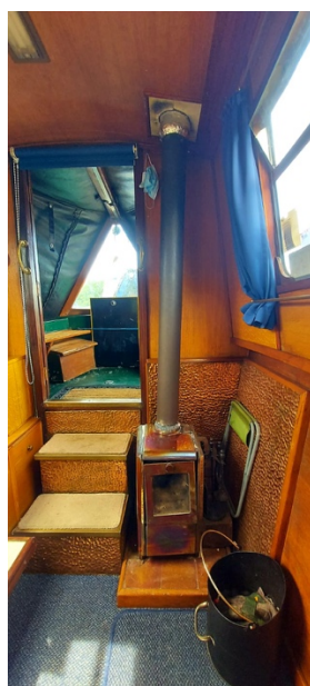
▲ Stove facing fore