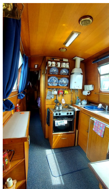
▲ Galley facing aft