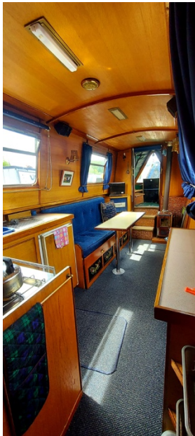
▲ Galley facing fore