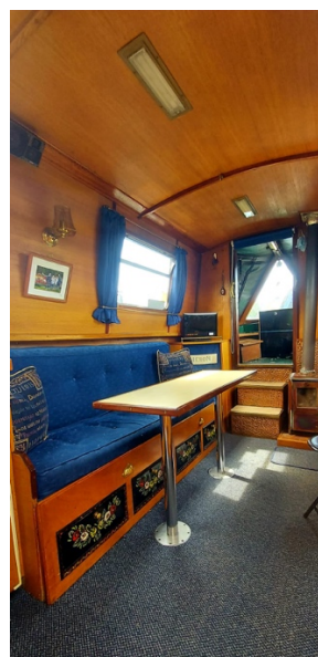
▲ Saloon facing fore