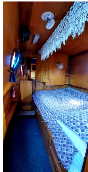
▲ Bedroom facing aft