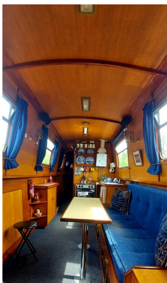
▲ Saloon facing aft