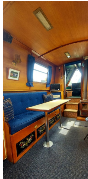
▲ Saloon facing fore