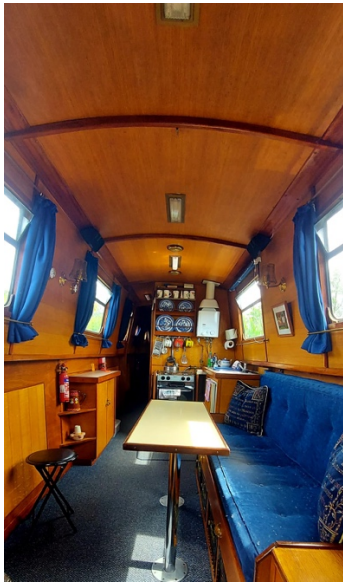
▲ Saloon facing aft