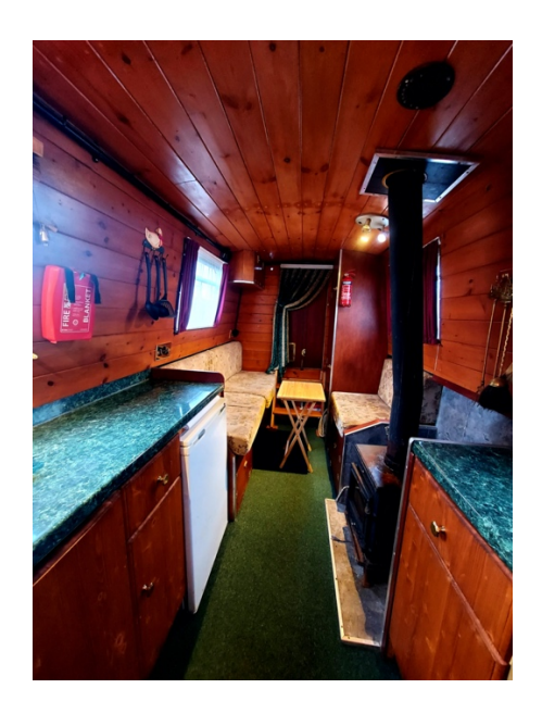
lacktriangle Galley facing fore