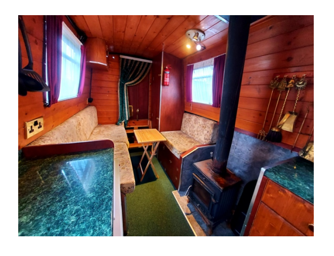
▲ Saloon facing fore with stove