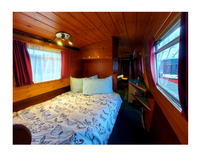
▲ Bedroom facing fore