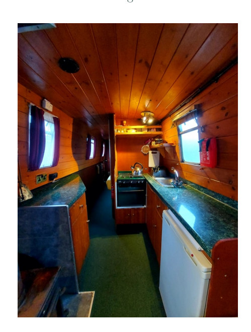
▲ Galley facing aft