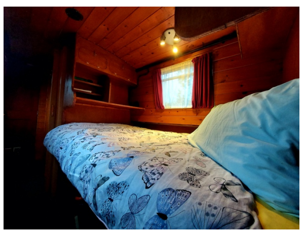
▲ Bedroom facing aft