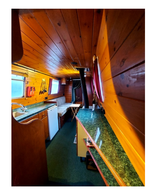
lacktriangle Galley facing fore