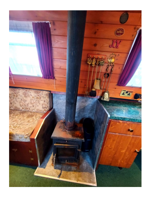
▲ Stove starboard side