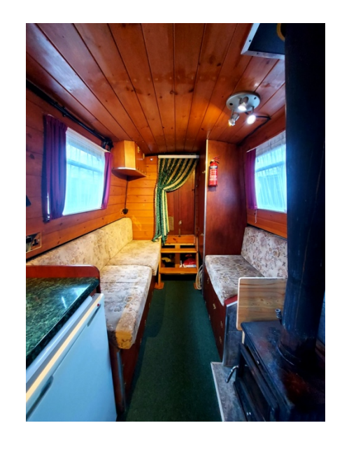
▲ Saloon facing fore