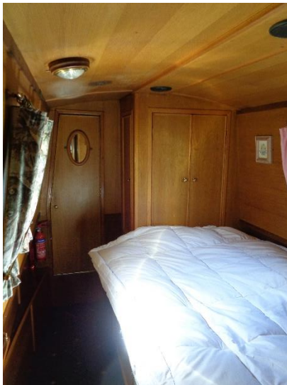
▲ Bedroom facing aft