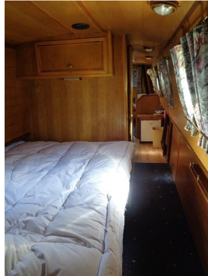
▲ Bedroom facing fore