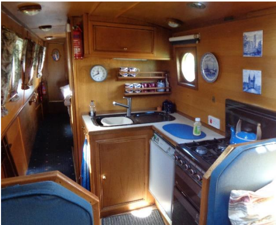
▲ Galley facing aft