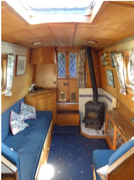
▲ Saloon facing fore