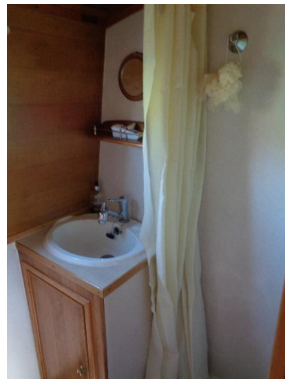
▲ Shower room