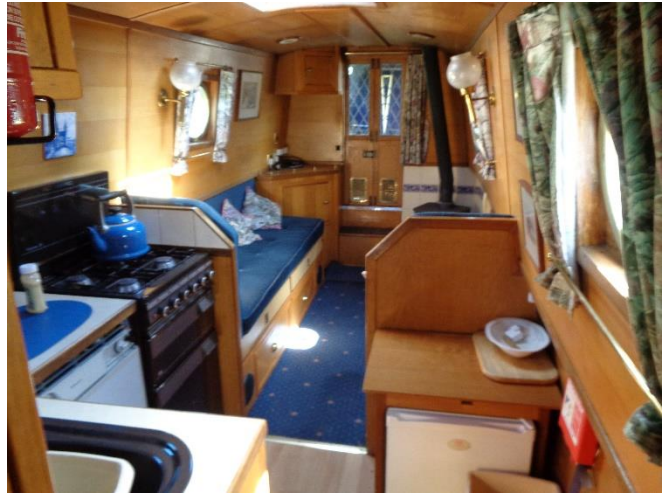
▲ Galley facing fore