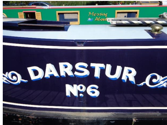
▲ Darstur Signwriting