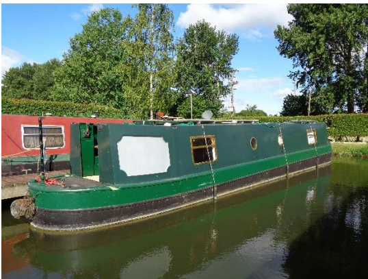
▲ External View