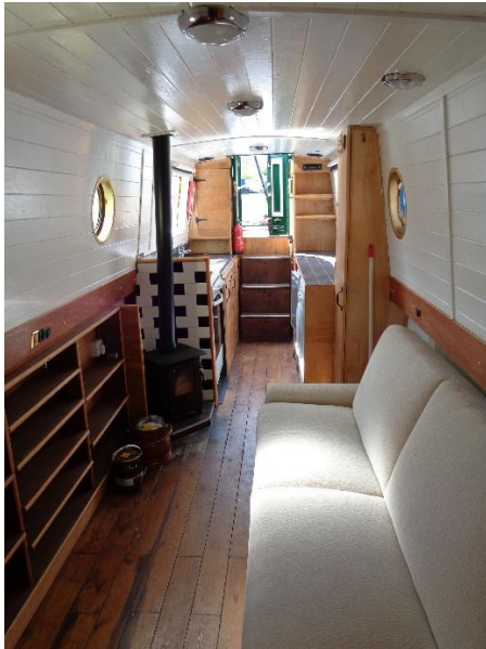
▲ Saloon facing Aft