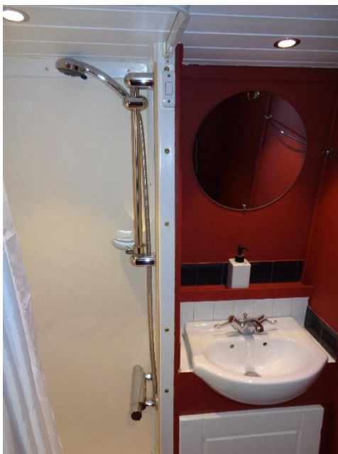
▲ Shower room