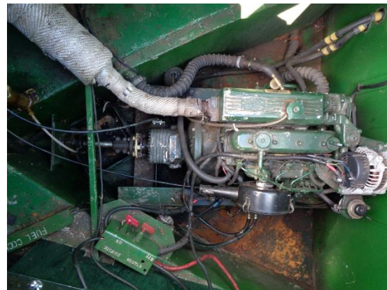
▲ Engine - Beta 34