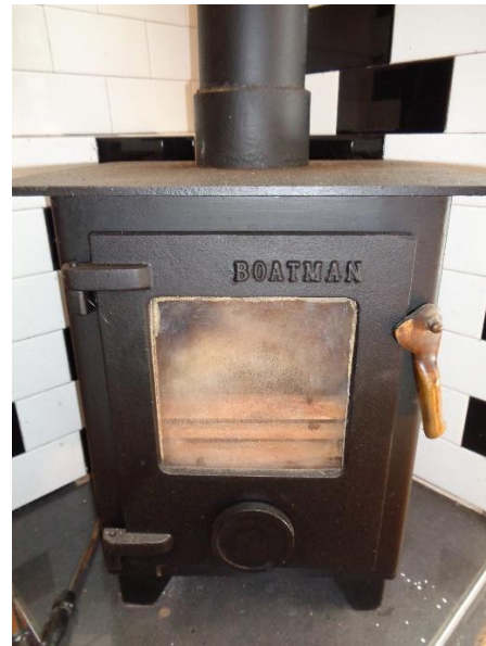
▲ Stove in Saloon