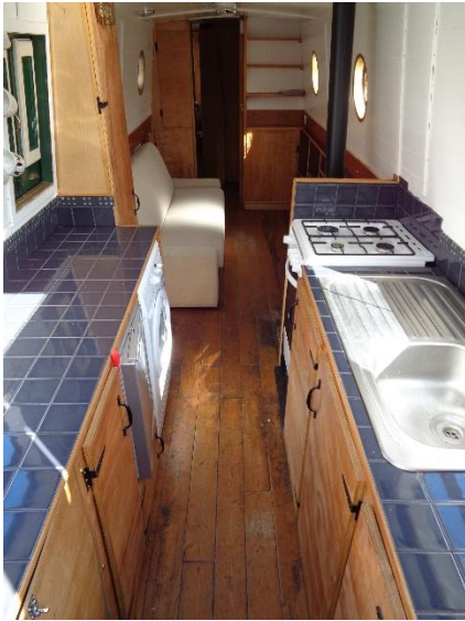
▲ Galley facing Fore