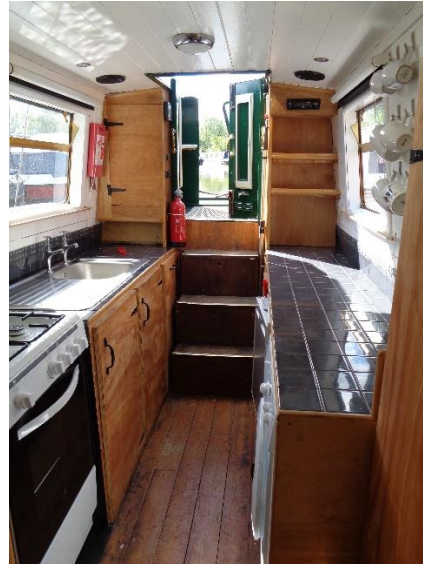
▲ Galley facing aft