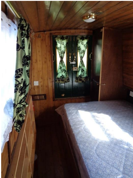
▲ Bedroom Facing Fore