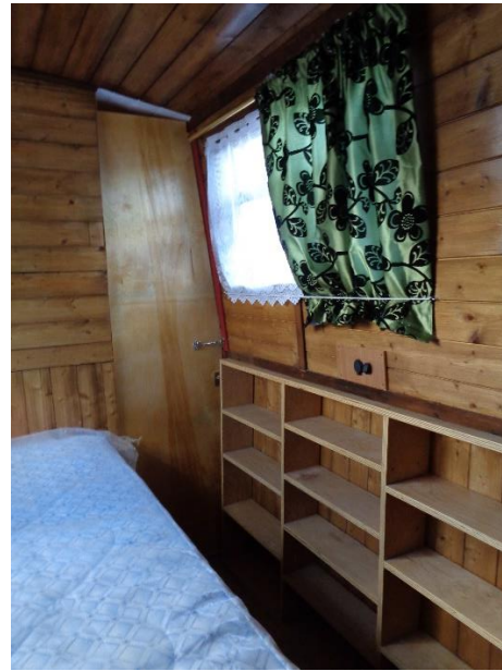
▲ Bedroom facing aft