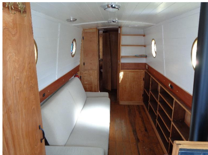
▲ Saloon facing Fore