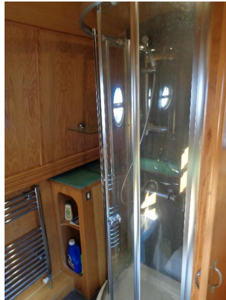
▲ Shower room cubicle