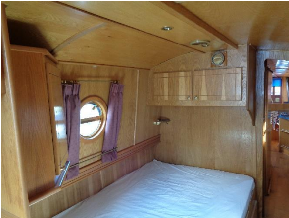
▲ Bedroom facing fore