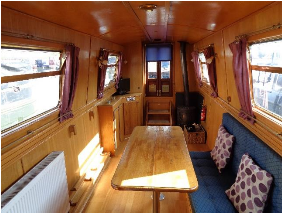
▲ Saloon facing fore