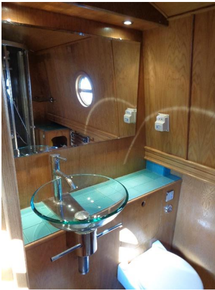
▲ Shower room sink