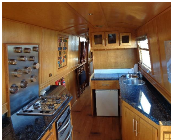
▲ Galley facing aft