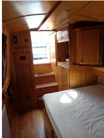
▲ Bedroom facing aft