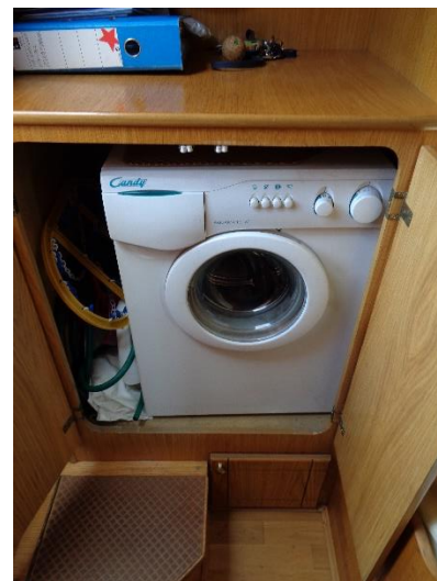
▲ Washing machine