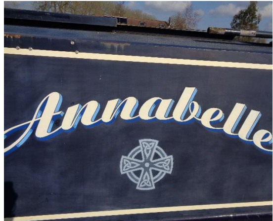
▲ External Paint work