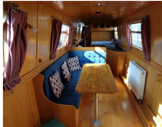
▲ Saloon facing aft