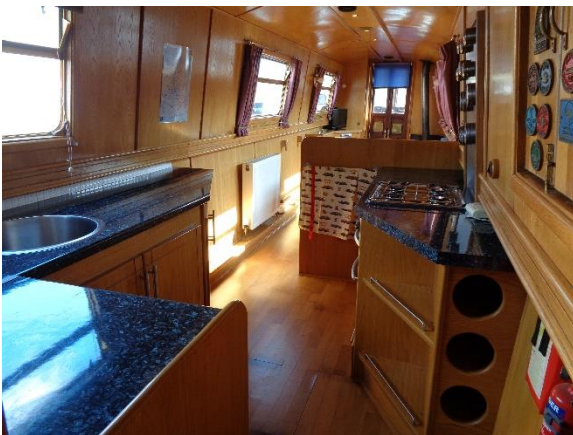
▲ Galley facing fore