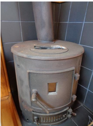
▲ Barrel stove