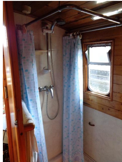
▲ Shower room