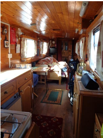
▲ Galley facing fore