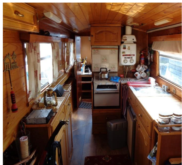
▲ Galley facing aft