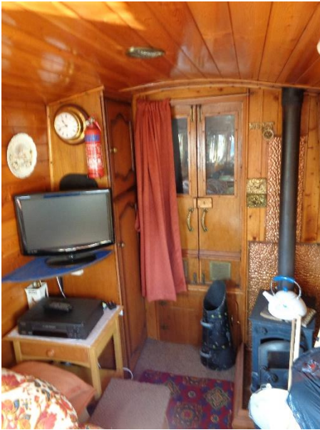
▲ Saloon to Bow doors