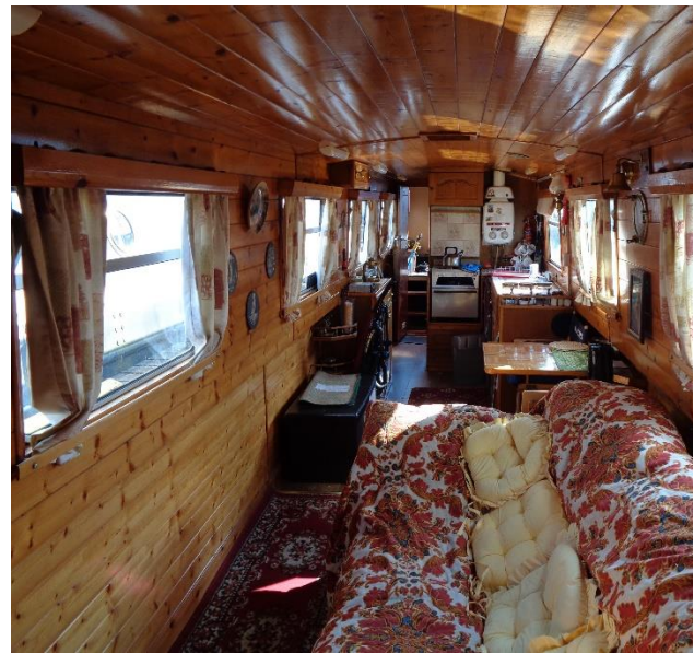
▲ Saloon facing aft