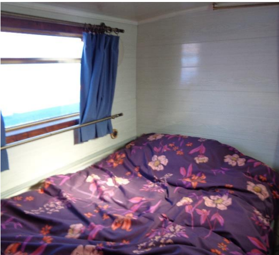
▲ Bedroom facing Fore