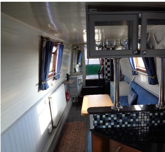
▲ Galley to Saloon