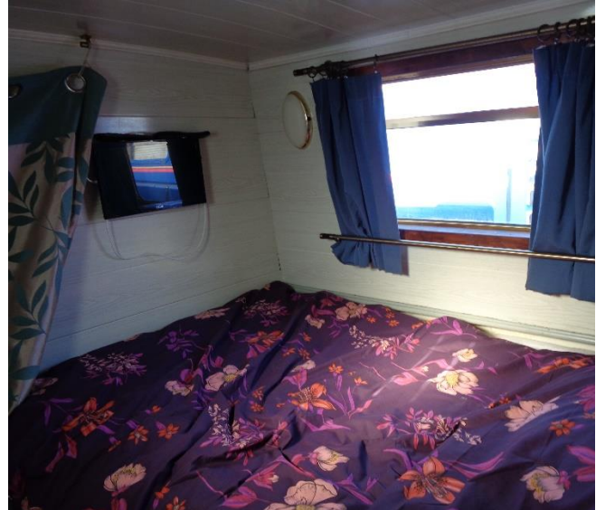
▲ Bedroom facing aft