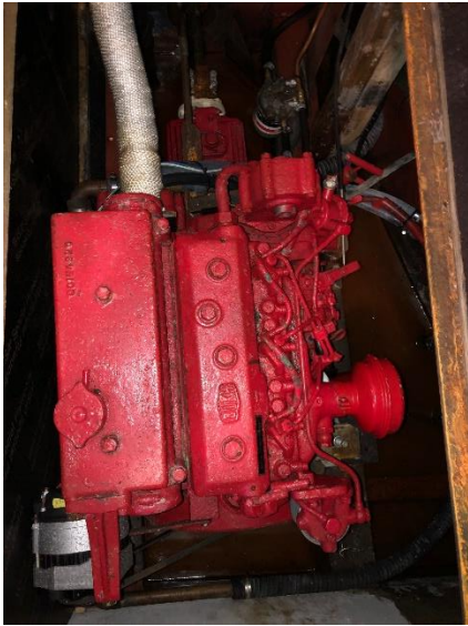
▲ BUKH Diesel Engine