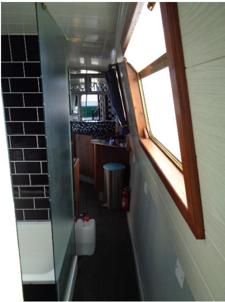
▲ Bathroom corridor