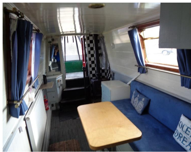
▲ Saloon facing fore